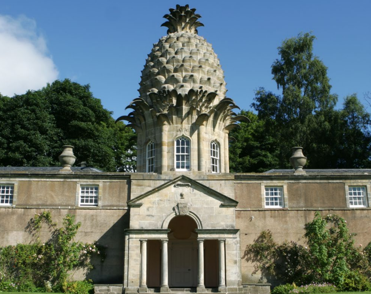
The Pineapple, Dunmore

Our charity rescues and restores historic buildings, transforming them into uplifting holiday accommodation. Escape the everyday in castles, forts, towers and cottages across Scotland and beyond.