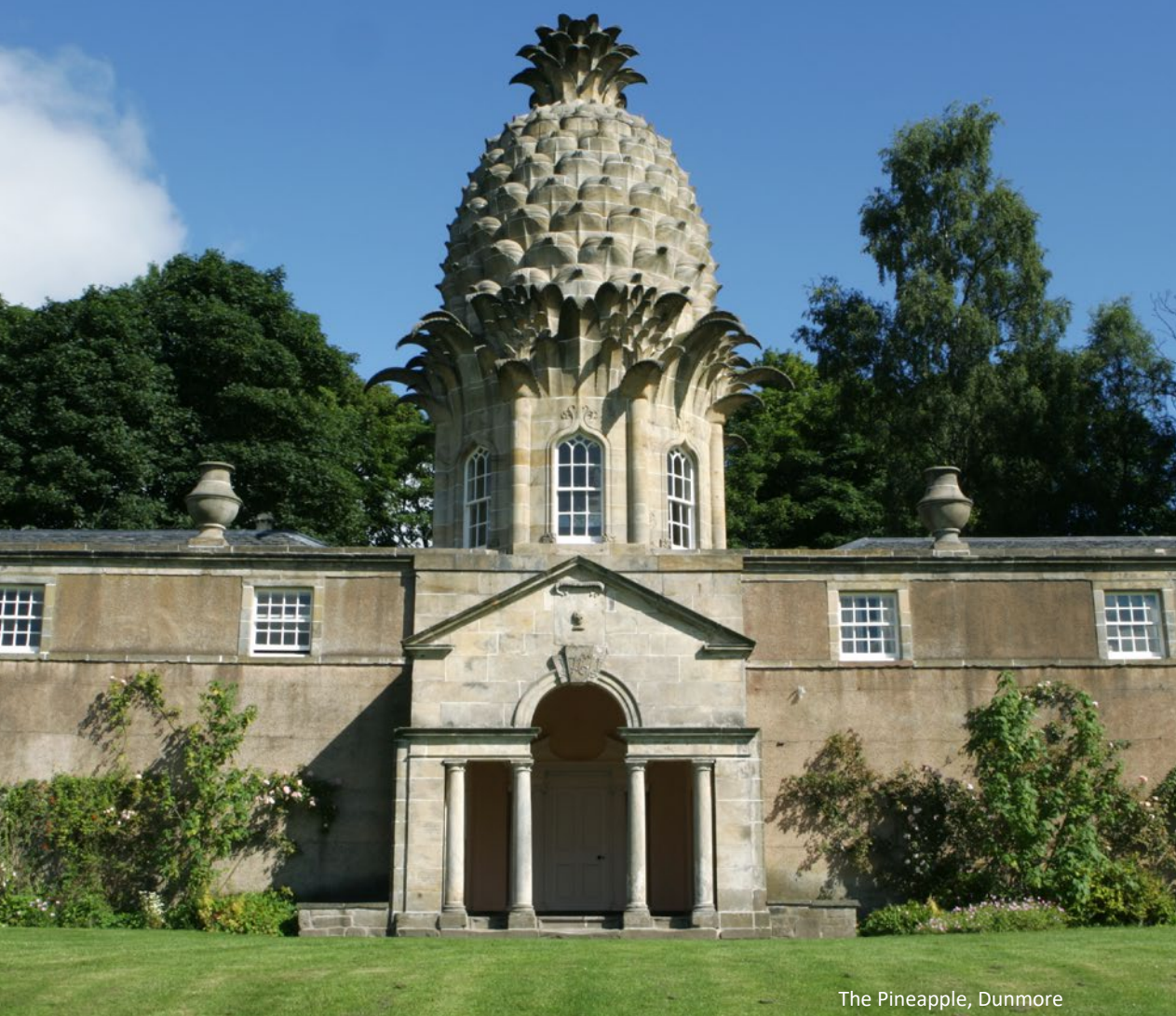
The Pineapple, Dunmore

Our charity rescues and restores historic buildings, transforming them into uplifting holiday accommodation. Escape the everyday in castles, forts, towers and cottages across Scotland and beyond. landmarktrust.org.uk/rsno